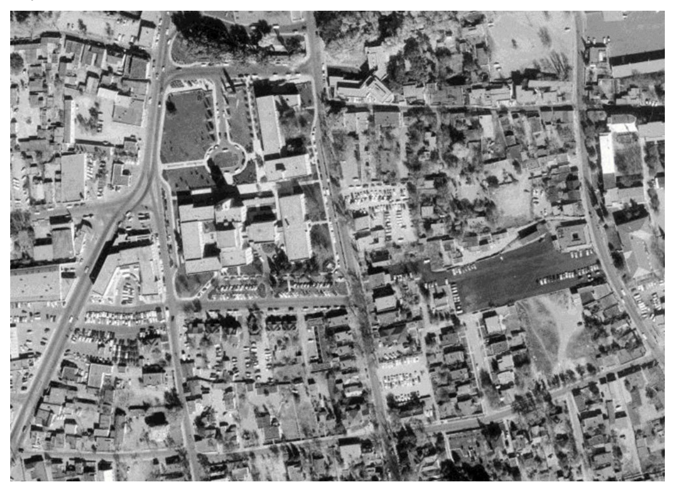
Figure 2 1958 Aerial

The subject structures proposed for demolition represent a building style typically found in the local Don Gaspar Historic District (which was established in 1983). The three southernmost buildings were constructed prior to 1930, and the original footprints of the buildings remain. As illustrated by the buildings' existence on the 1930 Sanborn Map and not on the 1921 Sanborn Map, the buildings were constructed between 1921 and 1930. The northernmost duplex structure was constructed prior to 1948. These buildings were constructed prior to the construction of Paseo de Peralta, which currently is a defining line between the Downtown & Eastside Historic District and the Don Gaspar Historic District. Historically, as evidenced by the urban pattern, the Don Gaspar design vocabulary extended north to the subject block.