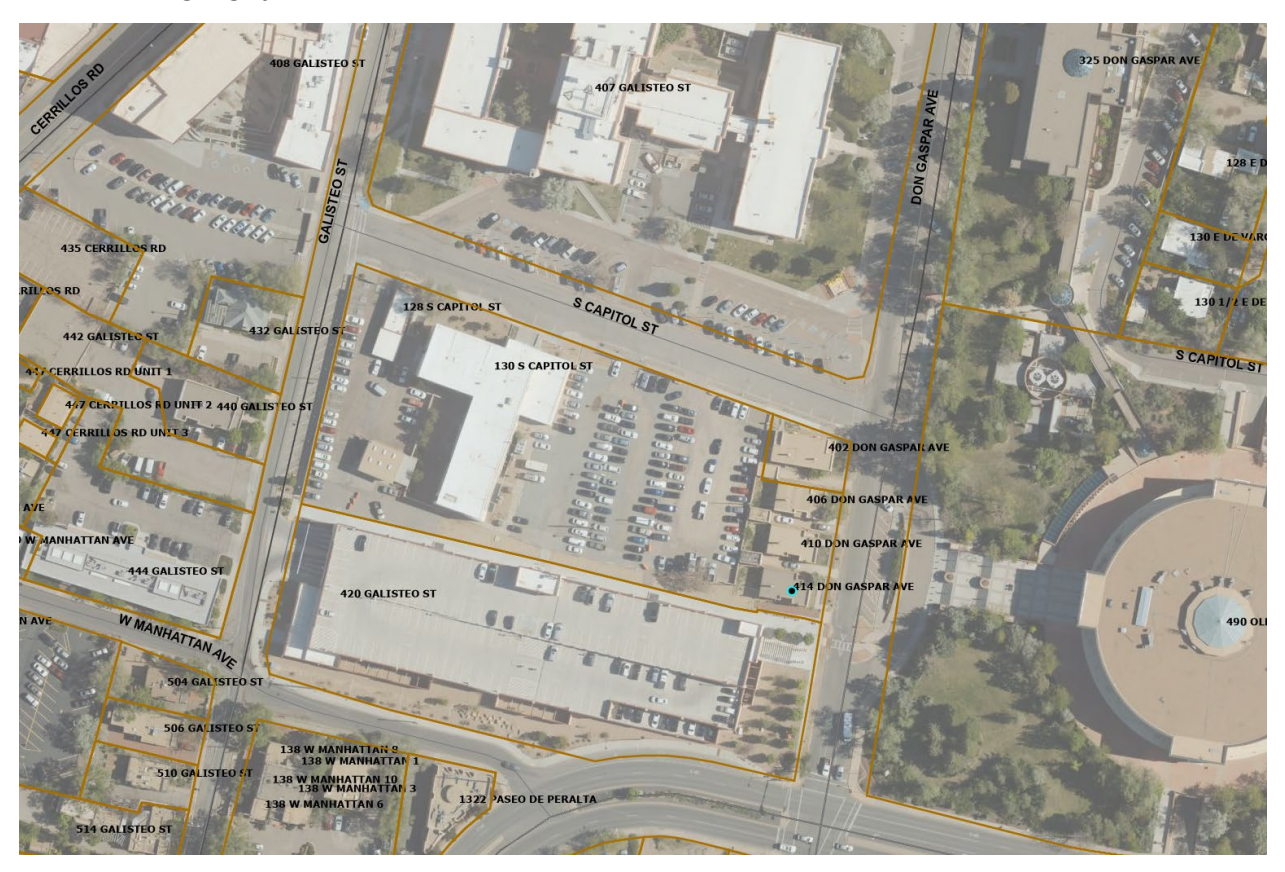
Figure 1 Vicinity Aerial - Present Day

Recognizing the fragility of the City's historic heritage, the purpose of Subsection 14-5.2(M) is to activate the procedure established in Section 3-22-6 NMSA 1978 under which the City and the State will collaborate in good faith and work jointly to preserve and protect the historic districts in Santa Fe as well as contributing, significant, and landmark structures.